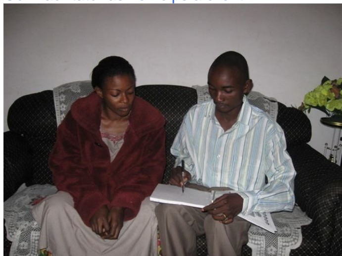
Our Facilitator as he helps a client...

EF® looks deceptively simple but it takes intensive energy and commitment to deliver and receive the training necessary to put in place such a nurturing framework within a community. Once the Facilitator and Board are in place and trained, as they are now in Kamina , and the first few aspiring entrepreneurs demonstrate success, then success breeds success. This is not a project with an end-date. Enterprise Facilitation is self-sustaining!